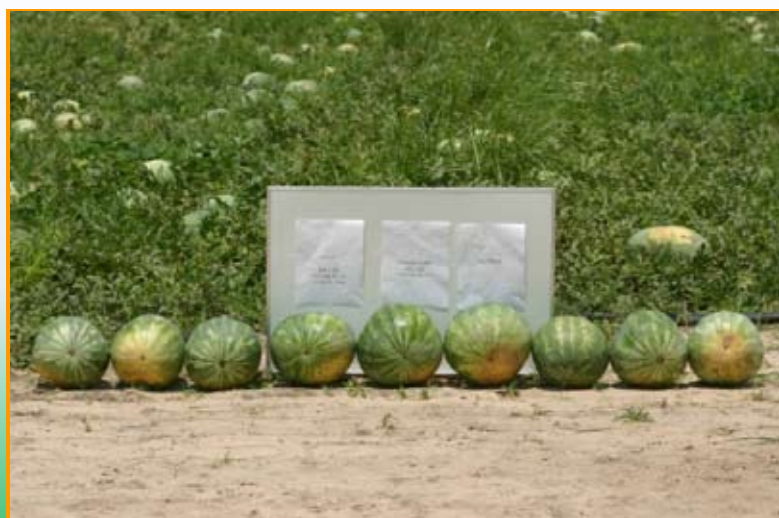
VAPOR GARD Improves Fruit Size Under Limited Irrigation