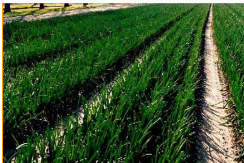
VAPOR GARD ( 3.5 Litres/ha at bulb initiation)